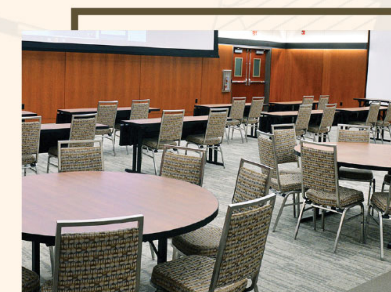
HALF CLASSROOM & ROUNDS